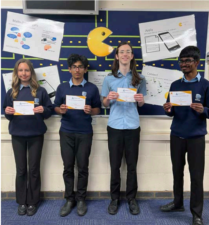
Above left, students with their Junior Maths Challenge certificates, above right, students with their Intermediate Maths Challenge certificates.