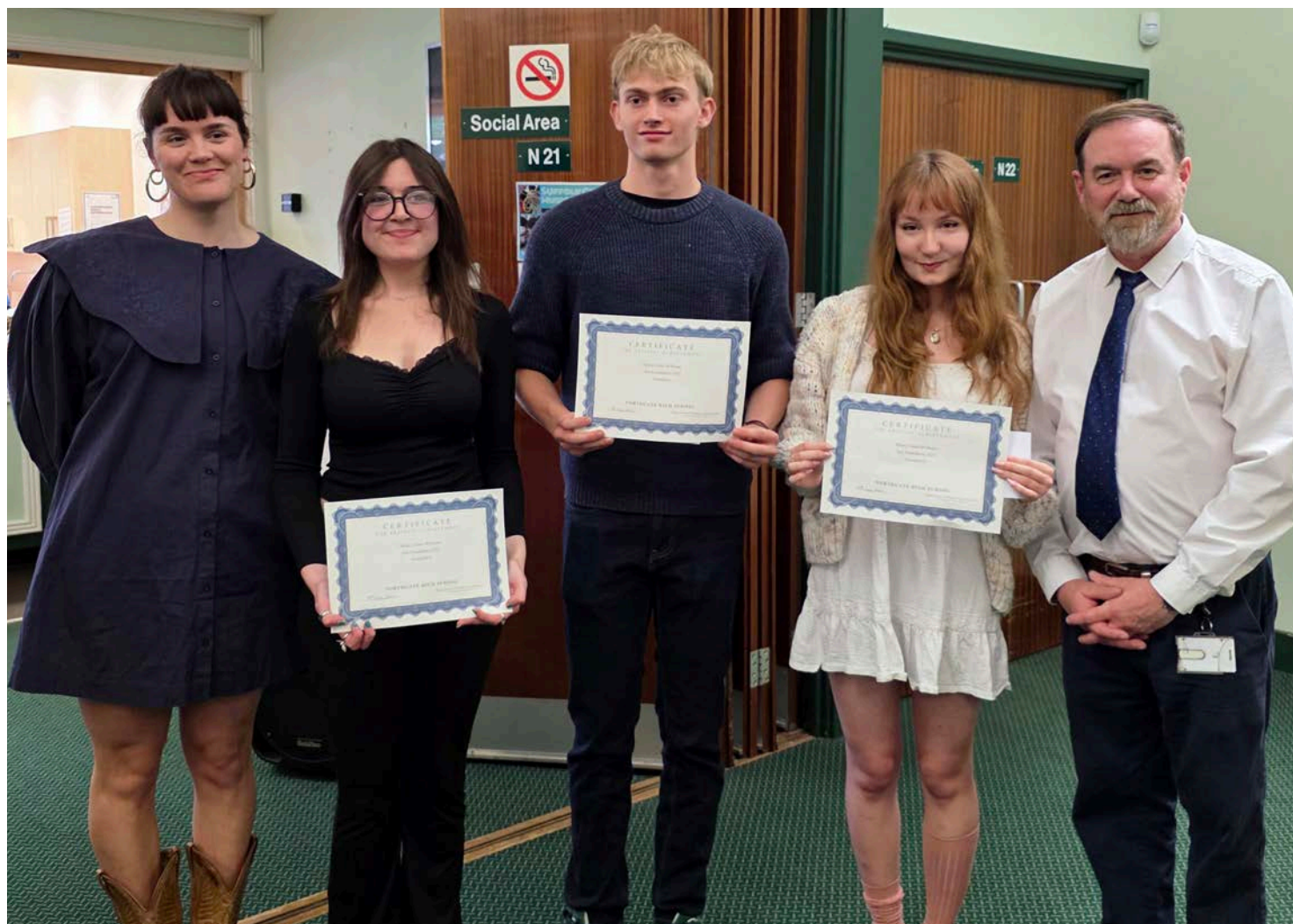
The winners of the annual Henry Curtis-Williams Award.