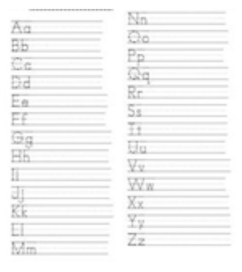
Remember the invisible lines