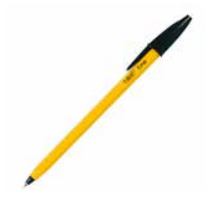
Use a pen

The following sentence uses every letter of the alphabet.