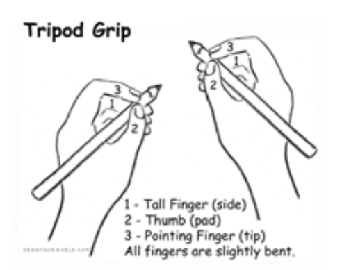
Hold your pen correctly