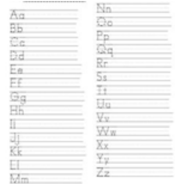
Remember the invisible lines