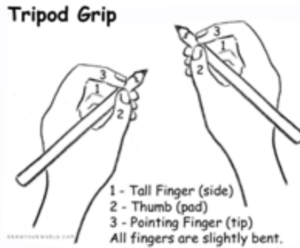
Hold your pen correctly