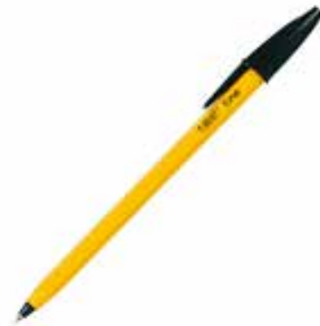
Use a pen

The following sentence uses every letter of the alphabet.